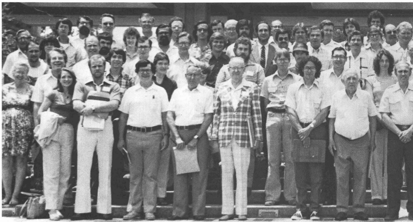
CAST OF CHARACTERS (more or less: there are names without faces, faces without names!)