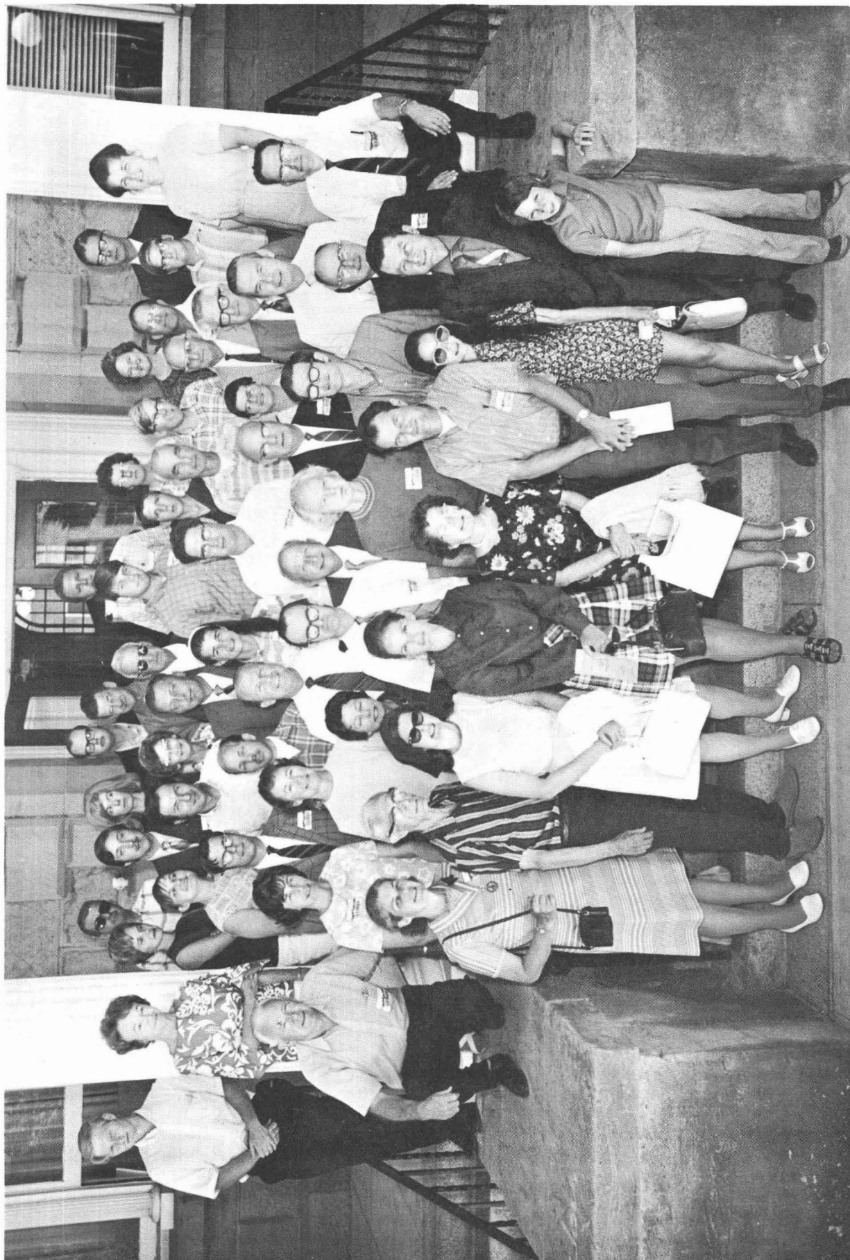
PHOTO OF ANNUAL MEETING