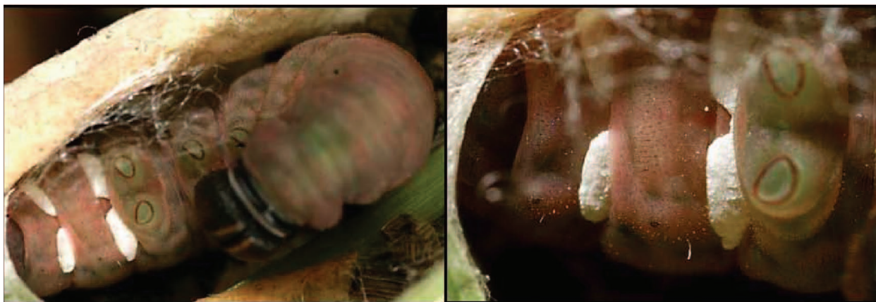
FIG 2. Ventral glands and white flocculent secretion in H. colorado idaho

H. juba . Eggs laid in May 2005 and September 2006 took 10–11 days to hatch at temperatures between 20–30°C. In contrast, virtually all eggs laid in mid October 2005 entered dormancy and did not hatch until the following February or March (Table 2). One egg in this cohort (N = 25) hatched in 14 days and overwintered as a first instar larva (see below). Overwintering eggs contained fully developed embryonic first instar larvae, indicated by conspicuous darkening of the micropyle and verified by dissection. Hatching of overwintered H. juba eggs was staggered, occurring over a six week period. Development of early instar larvae in the spring (May 2005) cohort was initially rapid with fifth instar reached within four weeks (Table 2). All instars silked grass blades together to form shelters, with construction more complex in each successive instar. Ecdysis invariably occurred within these shelters. First instars simply wove a few silken strands into a vague 'nest', while pre-pupal final instars constructed tightly webbed shelter tubes. Nest-building characteristics may differ under natural conditions (MacNeill 1964). Fifth instar larvae entered an apparent