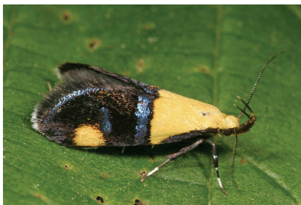
FIG. 2. Live O. bractella female from Bellingham, Washington.

The establishment of breeding populations of O. bractella in North America has been confirmed at two locations (Bellingham, Washington, and Burnaby, British Columbia), where immatures were found in spring 2007. At Burnaby, a half dozen unknown larvae living under the peeling bark of a dying Alnus rubra were collected for rearing in March. On May 3 an adult male O. bractella was found in the rearing chamber. Subsequent collections in this riparian habitat yielded specimens on many different A. rubra offering similar larval habitats, as well as one ornamental Acer sp. in a nearby landscaped environment. Most collections were on dying standing trees, but some were on recently felled