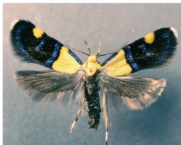
FIG. 3. O. bractella female from Port Coquitlam, British Columbia.