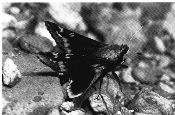
FIG. 1. Yucca Giant-Skipper, Megathymus yuccae , Calloway Co., Kentucky, 13 April 2001; photo by Loran D. Gibson.

The Yucca Giant-Skippers were found amidst a