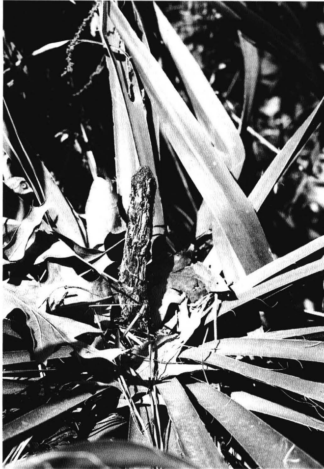
FIG. 3. Yucca Giant-Skipper food plant, Yucca filamentosa L., with larval "chimney," Calloway Co., Kentucky, 18 April 2002; photo by W. R. Black, Jr.

colony of Yucca, Yucca filamentosa L. (Liliaceae), consisting of approximately two or three dozen plants scattered along the shoulders of a gravel road. The site extended for approximately 245 m (200 yards) and was situated on a ridgetop of dry, gravelly soils. The surrounding vegetation consisted primarily of relatively young, second-growth upland oak-hickory forest. There were also numerous Loblolly pines, Pinus taeda L. (Pinaceae), a species not native to Kentucky, scattered throughout the forest and roadside. The roadside shoulders were vegetated with young trees, shrubs and weeds, providing a more open habitat for the yucca plants to grow and spread. The senior author was notified of the find, and he was able to relate the fact that characteristic larval "frass chimneys" should be present within nearby yucca plants if the skippers had been established at the site prior to the observation. Subsequently, three such structures were located in yucca plants along the roadside. Later that day, the senior author confirmed the identification and pre-