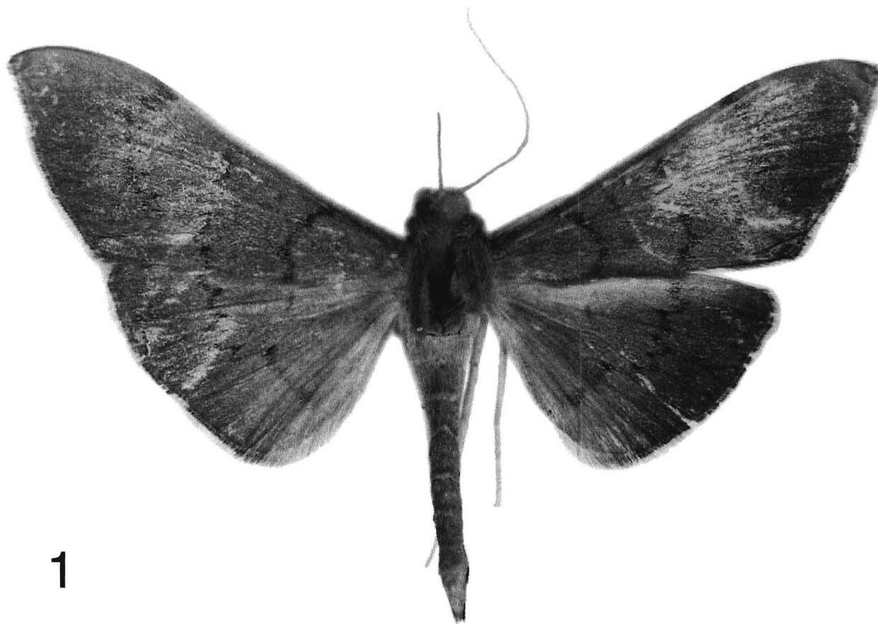
FIG. 1. Paratype adult male of Omiodes pseudocuniculalis , Ecuador, Environs de Loja. Wing length = 16 mm.

spatulate scale, presumably for scent production and/or distribution." ] Female : unknown.