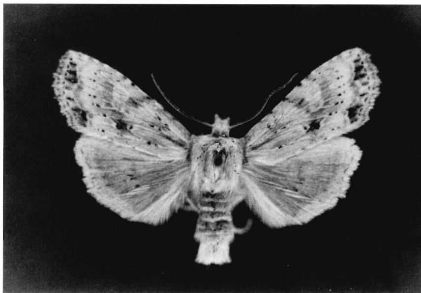
FIG. 1. Lithophane franclemonti n. sp., holotype male. USA: OHIO, Wyandot County, Pitt Township, Killdeer Plains Wildlife Area, 40°42.5'N, 83°13.8'W, 27 March 1997, Eric H. Metzler.

franclemonti has two strongly delineated lateral ridges, the distal end of the juxta is spoon shaped and blunt. The juxta is narrow, without lateral ridges, and tapers to a point in L. innominata .