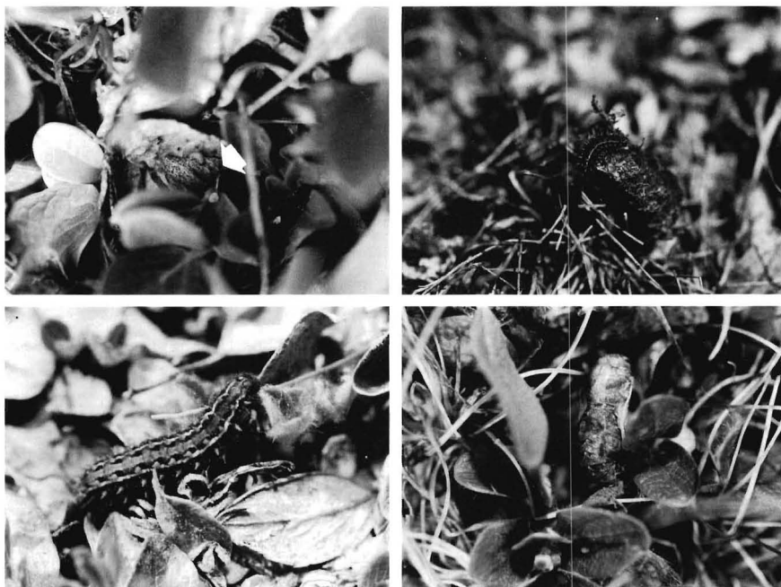
FIG. 1. Immature stages of Boloria acrocnema . Clockwise from top left: first instar and egg casing, third instar, pupa, fourth instar.

vae successfully produced adults, while 2 died of unknown causes. In 1992, larvae were found on June 29 and July 2, and in 1993 a single later instar larva was found July 7. All later instar larvae were found at RC1 near oviposition sites, determined the previous summers. Caterpillars were observed feeding and basking for 2–3 days before nesting (larvae make a leaf shelter) and pupation. During the hours prior to nesting, larvae were observed to move rapidly around the enclosures and appeared to test areas for possible pupation sites. This behavior included crawling under litter, beginning to make a nest and then arresting movement. Finally, each caterpillar chose a site with densely packed litter and nested. In one case the larva burrowed under a large dead leaf and attached itself horizontally to the underside of the leaf, silking together debris (dead leaves, lichens, and bits of grass) to form a nest. No movement occurred after nesting and pupation began. In 1992, adults eclosed on August 2 and on August 7. Both of these larvae had pupated on July 7 (Fig. 1). In 1993, pupation was observed on July 9 and the butterfly eclosed on July 29. Therefore, in 1992 and 1993 the duration of pupation was 21 to 32 days.