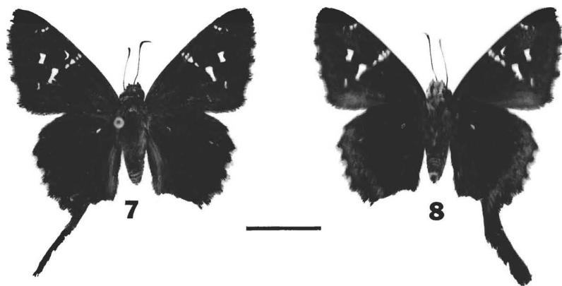
FIGS. 7-8: Urbanus dorantes santiago (Lucas), ♀, upper (7) and under (8) surfaces: GRAND CAYMAN I[SLAND]: Great Beach, N of quarry; Sta. GC-3; 2.xi.1990 (S. R. Steinhauser & Z. M. Schwendeman) Allyn Museum photographs 911106-1/3. Scale line = 10 mm.

Urbanus dorantes santiago (Lucas, 1857): This Cuban endemic subspecies was rep-