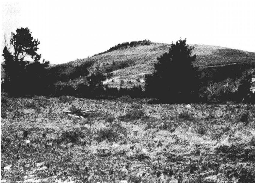
Fig. 1. Habitat of Oeneis alberta in the Little Snowy Mts., Golden Valley Co., Mont.