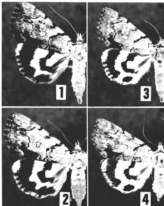
FIGS. 1–4. Catocala adults from the C. charlottae type locality. 1, C. charlottae , ♂ holotype; 2, C. charlottae , ♀ allotype; 3, C. alabamiae , ♂ coll. 13 May 1985; 4, C. alabamiae , ♀ coll. 10 June 1985.

and size; the only noticeable exterior difference is the slightly darker appearance of Florida specimens. Forewing lengths of male Louisiana C. charlottae ( N = 108 ) average 7% larger than those of male Louisiana alabamiae which average 18.2 mm (16.6–19.5 mm, N = 20 ). Forewing lengths of female Louisiana C. charlottae ( N = 32 ) average 9% larger than those of female Louisiana C. alabamiae which average 19.1 mm (17.9–20.1 mm, N = 14 ). The upper forewings of C. charlottae lack the overall blue-green suffusion present on C. alabamiae . Occasionally, fresh C. charlottae exhibit a few diffuse greenish scales around the reniform, but these are sometimes evident only with magnification.