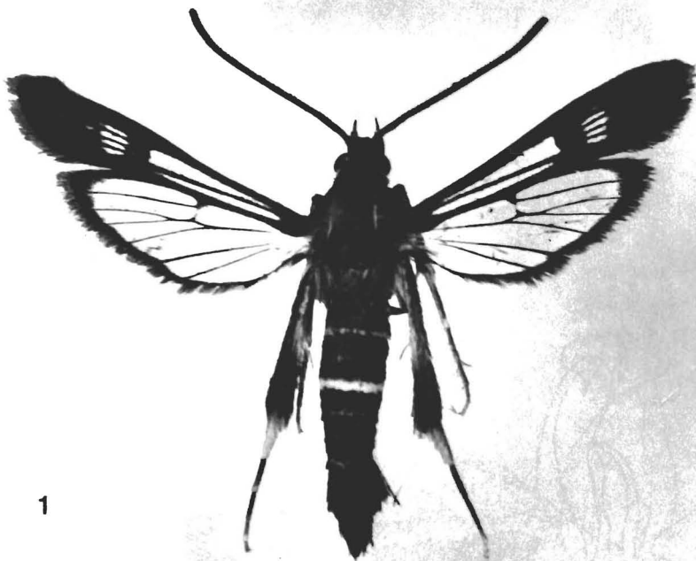
FIG. 1. Carmenta laurelae , adult male.

Abdomen. Mostly brown-black, dorsally with narrow orange-yellow band at posterior edge of segment 2, broader but still narrow band on posterior margin of segment 4, very narrow band on posterior edge of segment 7; ventrally with narrow orange-yellow bands on posterior margin of segments 4–7; anal tuft somewhat wedge-shaped but truncate at apex, with some orange-yellow at tips of lateral scales and ventrally on tip of abdomen.