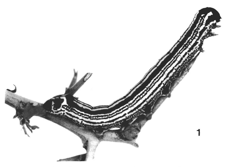
Fig. 1. Cargida pyrrha, mature larva, Guadalupe Canyon, Cochise County, Arizona.