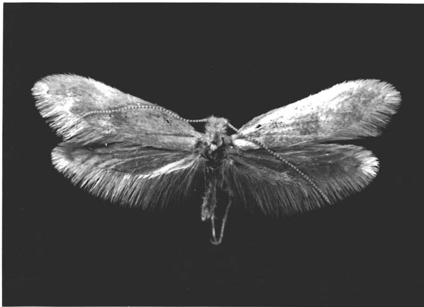
FIG. 1. Acanthopteroctetes aurulenta , new species. Holotype ♂, wing expanse 15 mm.

Head. Vestiture rough, pale yellowish brown to nearly white. Antennae with 43 segments; vestiture of scape extremely rough with prominent pecten of more than dozen