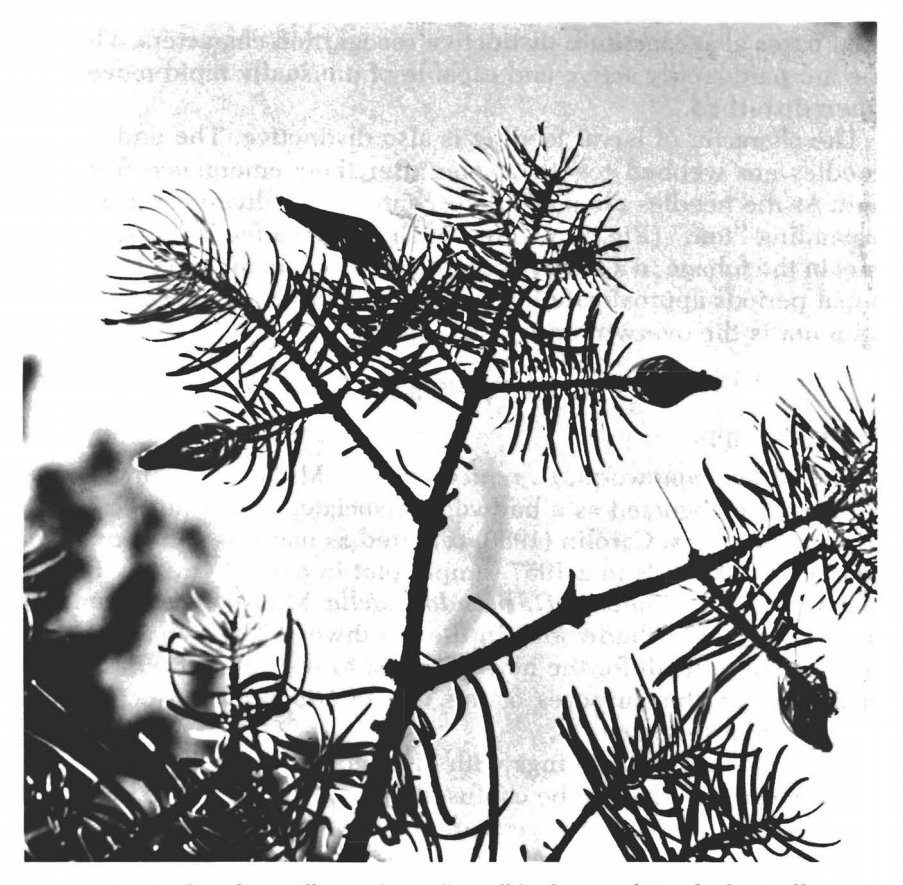
Fig. 2. White fir needles tied into "tents" by larvae of Ypsolophus nella.