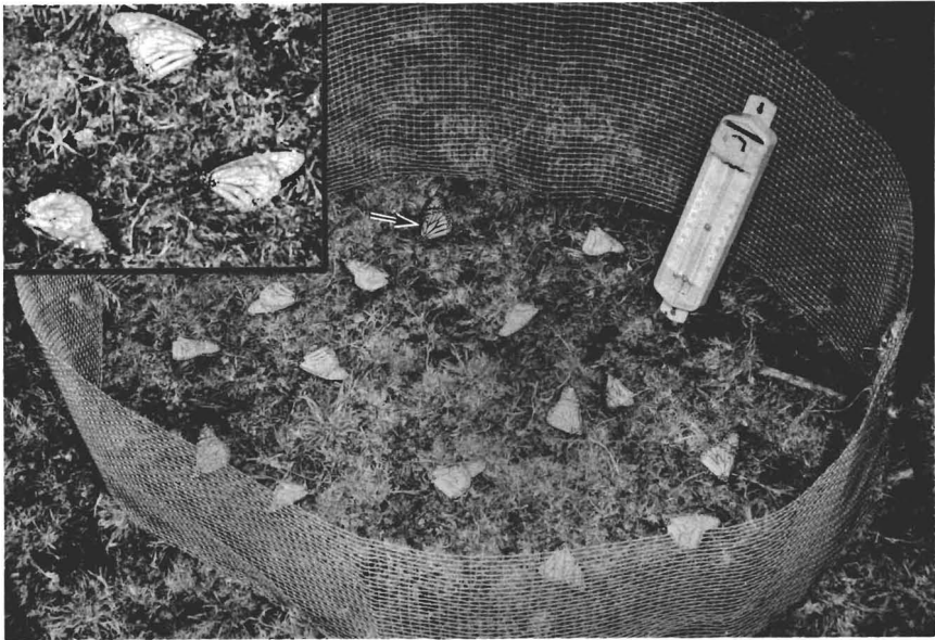
FIG. 2. Hardware cloth enclosure used to delimit observation areas. Heavily frosted butterflies lie on the ground. Butterfly at top center (arrow) is more upright in posture and consequently did not suffer as much frosting. Inset: Enlargement of frosted butterflies in enclosure (2 \times ).