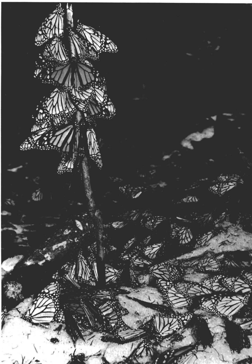
FIG. 1. Monarch butterflies knocked down from their roosts by a snowstorm. Some have managed to get into relatively warmer air by crawling up the stem of Senecio angulifolius DC.