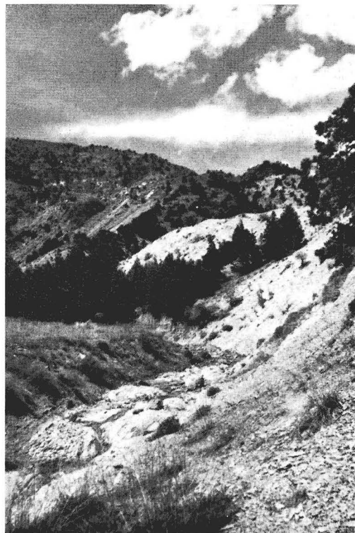
Fig. 7. Melitaea vedica n. sp., type locality. Thin forest of Juniperus polycarpus at an elevation of 1400 m, Chosrov Wildlife Reservation (Armenia).

stronger. The sexual dimorphism is so poorly expressed that there is no need to figure a female.